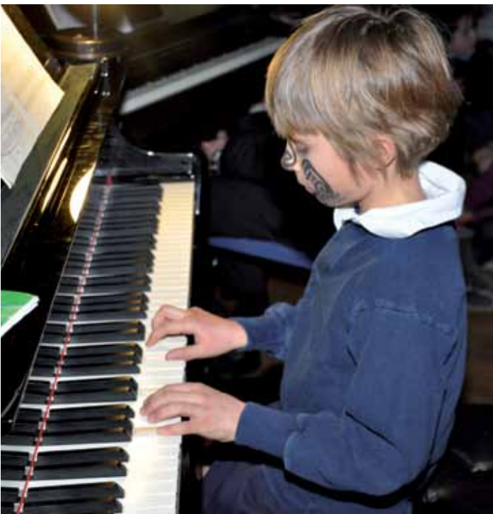
Junior Concert performer