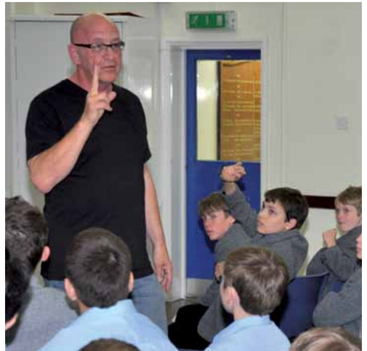
Michael Grant – a very popular author

There was an exciting start to the annual trip to Burgundy last year. The Year 7 boys got up for an early breakfast, to ensure a prompt start, and in making their toast they managed to set the fire alarm off! As a result the whole school had to get up and go outside in the rain - and enjoy the opportunity of seeing the departure of the Year 7 boys! The group drove to the Channel Tunnel for the 20 minute trip, before setting off for Maison Claire Fontaine, where they arrived at 6pm. There the team of