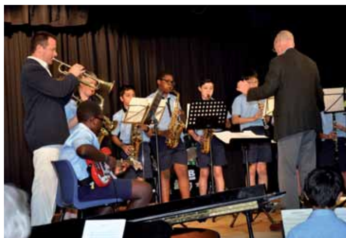
Staff and Boys playing together in a concert