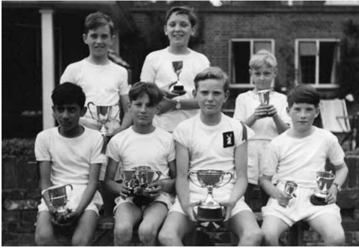
Athletics Champions, but of what year and who are they?