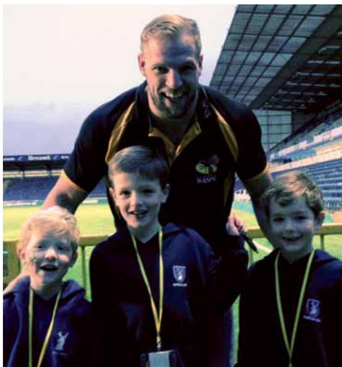
James Haskell, playing for Wasps, with three Papplewick fans.