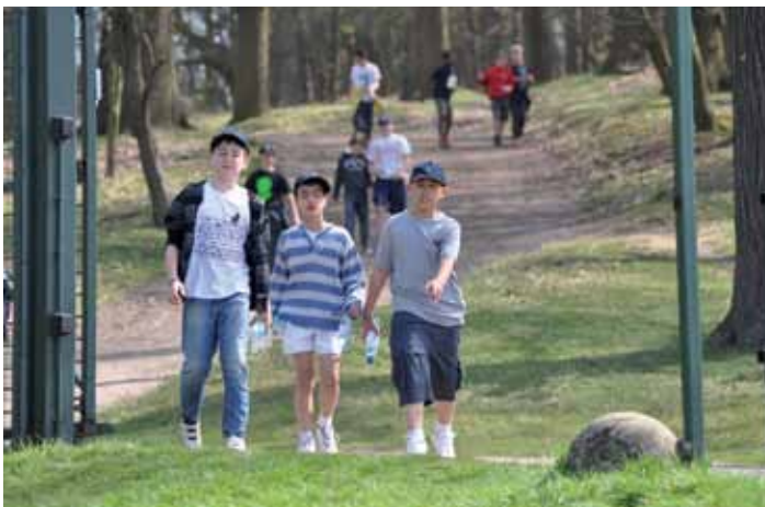
Sponsored Walk 2013

This was entertainment put on by the Under 10s containing singing, comedy acts, recitations, dancing and variety in the widest sense of the word. After a rousing performance of the 'Welcome to Papplewick' song, sung by everyone in the Lower School, there was a comedy act with some well-timed and funny jokes, followed by some handclap rap, which made the audience eager to join in. Then the whole of Year 3 took to the stage for a fast, forceful and heartfelt haka. One form recited 'The Crocodile' by Roald Dahl and they were then joined on stage by another form to perform 'Une Petite Coccinelle', the second of two French scenes. Throughout the evening there were soloists of all ages performing, the costumes and props were superb, and there was a lot of audience participation. It was great to see the youngest members of the School able to perform so well in front of an audience, and we look forward to seeing them later in their careers acting in future School plays.