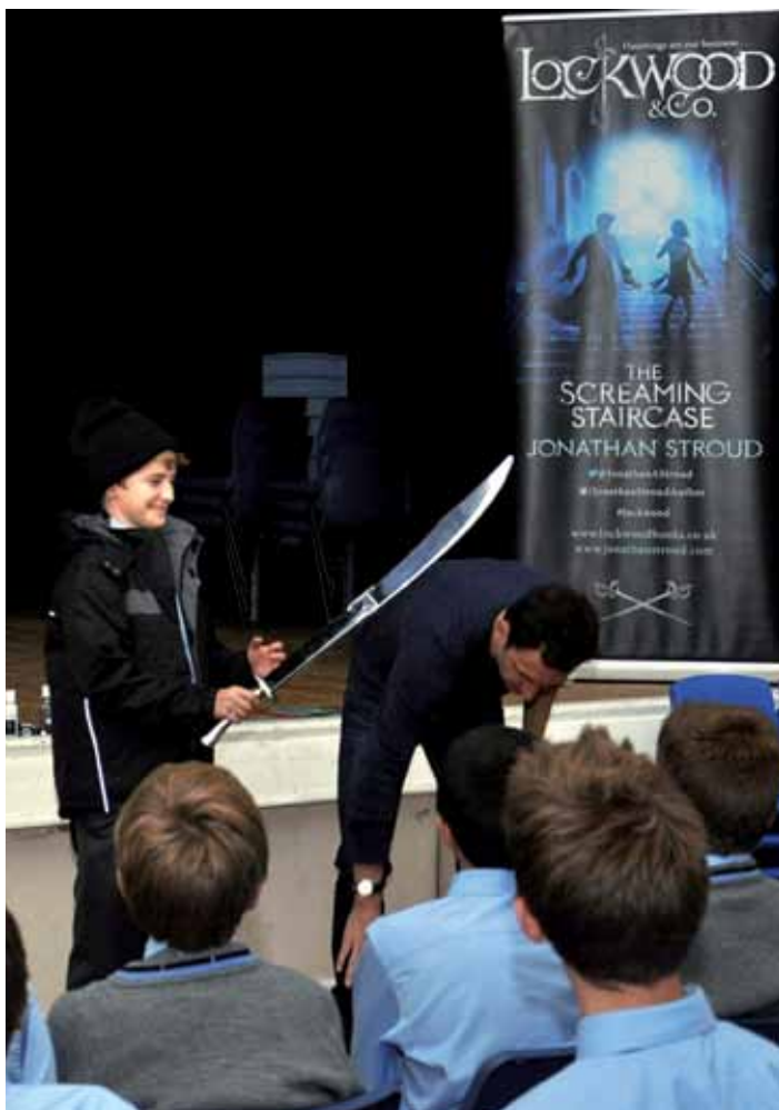
Author Jonathan Stroud

The world-famous author of the 'Gone' series, Michael Grant, received an enthusiastic welcome from the older boys and our guests from other local schools, who were invited to come for the occasion. Excitement had been building before his arrival, as his books are very popular in school. He delighted his audience with his presentation and anecdotes about his life. Both authors were inundated by questions from eager audiences. As usual, when they had gone they left a buzz around school and a large number of boys engrossed in the new books they had just bought.