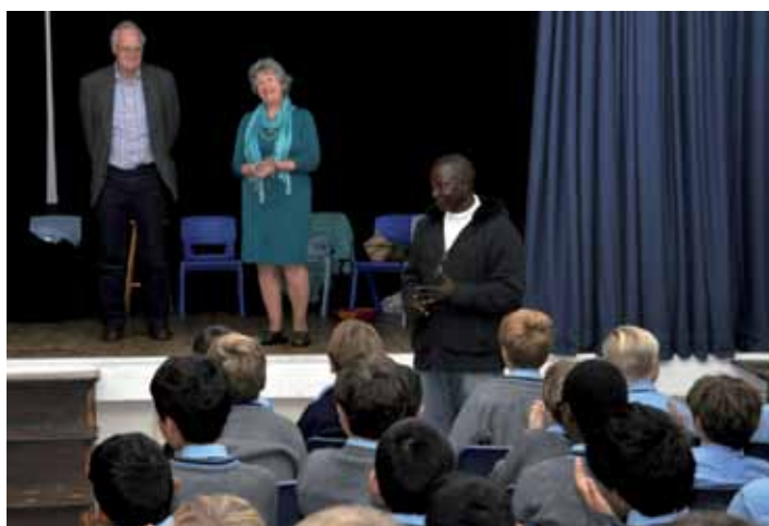
Representatives from Bethany Orphanage, Uganda, came to Papplewick to talk about their work, which is sponsored by boys in Years 5, 6 and 7