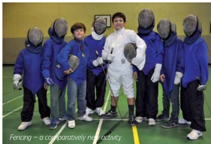
Fencing – a comparatively new activity

Every Thursday afternoon, as part of our activity programme, a small group of boys attends the Ascot Day Care Centre in Sunningdale. The idea is not only to develop our link with the community but also to raise the boys' awareness of what it is like living as a pensioner. The Day Care Centre is mainly run by volunteers who cover duties such as driving, cooking and cleaning. The aim of the centre is to allow elderly people to socialise with others and it gives the boys the chance to sit and talk to the members, asking questions about what life was like when they were younger. On the way back to Papplewick from Sunningdale, the boys always have plenty of animated things to say about what they have learned during the visits.