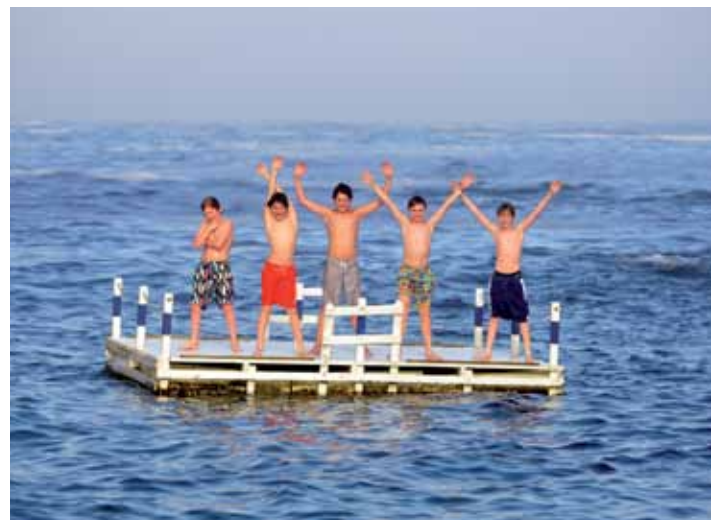
Having fun in South Africa

The rest of the tour was spent sightseeing, with indoor games of Action Cricket taking the place of outdoor matches. When we moved on to Durban we were lodged in Shakaland, a Zulu hotel complex camp next to a Zulu settlement. We were introduced to the Zulu chief, we sampled some traditional beer, and we saw some spear throwing and tribal dancing. Some found it a fascinating experience to see so much diverse culture in South Africa, not only in the cities but also in the tribal areas. The team moved on to Hill Top Camp, within Hluhluwe Game Reserve, and during the stay there we went on two game drives in the reserve, where we saw a leopard and a variety of other animals.