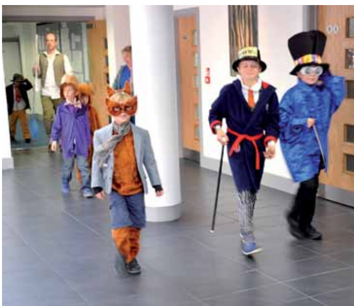
On the way to lessons on Roald Dahl Day

There were two perfect winter days in which to study the power of the waves and the process of Longshore Drift and the resulting projects would have made a very positive contribution towards the exams.