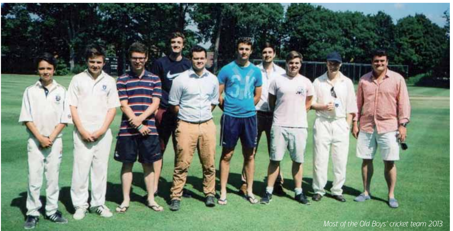
Most of the Old Boys' cricket team 2013

We shall be posting last minute details on the morning of July 13th, by 9.00 a.m., on the School website ( www.papplewick.org.uk ). Just click on 'About Papplewick' and 'Old Boys'. In the event of uncertain weather it is important to do this, as all activities may have to be cancelled at the last minute as they were, sadly, in 2012.