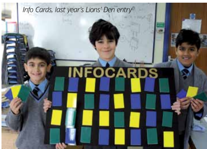
Info Cards, last year's Lions' Den entry

Last year the boys entered the D T competition 'Into The Lions' Den' for the second time. The trio was briefed to design and make a product that could make school lessons more enjoyable. The product also had to be able to be easily mass produced. After lots of brainstorming, the boys came up with 'Info Cards', which was both ingenious and simple. The concept provided every student in any classroom the wherewithall to provide immediate and anonymous feedback to the teacher by simply placing a colour coded plastic card on a board. The colour of the placed card would signify whether the pupil had understood fully, partially or not at all what had been taught. The three members of the Papplewick team had to pitch the 'Info Cards' idea to four entrepreneurs and an audience of parents, fellow competitors and teachers, which was no mean feat. As it turned out the boys presented their product very well indeed, coming third overall.