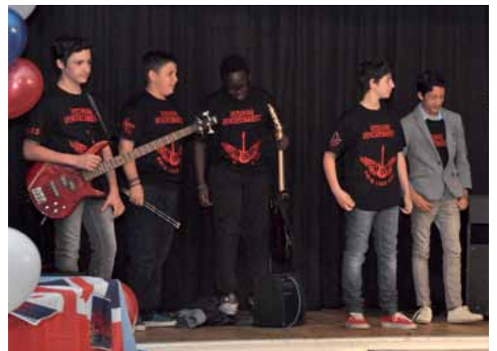
Papplewick's Got Talent - Sweet Sensation came second