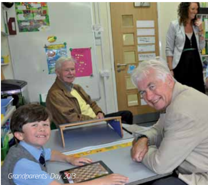
Grandparents' Day 2013