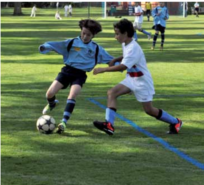
Football v St Catherine, Moorlands, Argentina

A term of rugby and a few weeks of cricket strangely did the boys the world of good, as they tied up the season with a win in the annual Papplewick v St. Catherine Moorlands, Argentina side, with a cracking winning goal to secure victory.