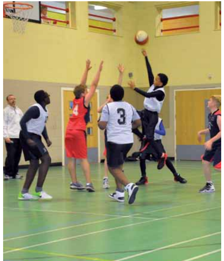
The Basketball players in action

The 2013 summer term's golf seemed to pass by very quickly. The weekly lessons with a professional coach at The Berkshire provided useful coaching, as our players had some tricky opposition to face during the term in the forms of Mouslford, Aldro and Ludgrove. But although there was so much improved play to admire, with team players demonstrating greater thought about the game and good driving and approach play, they failed to achieve any wins against our competitors. However, with the addition of the generously donated putting green at Papplewick and the ever-growing talent, the only way is up for our golfers.