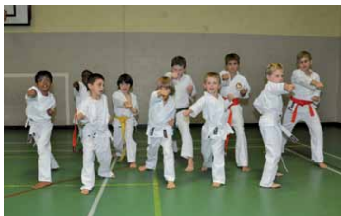
Karate is a popular sport

With the Nigel Havers trophy secured for the first time by Papplewick in 2012, our team could approach last year's fixture with confidence. The captain selected the four youngest players for the doubles round and things got off to a poor start, with numerous simple shots being flunked and the Ludgrove boys working well as a team. So we finished the round third and fourth. (Ludgrove 7 – Papplewick 3.) Next came the first of two "singles" rounds with the two senior Papplewick boys competing. Here we gained first and third positions and Papplewick was back in the frame, although we would require first and second in the final round for us to win the match. (Ludgrove 11 – Papplewick 9.) The final round was again a "singles" affair and from the start one sensed that the wind was now blowing in our favour. The Papplewick boys played well at the start, with an intelligent use of roquet, but there were some sticky moments towards the end as Ludgrove did their level best to come back. Their endeavours were in vain however, and Papplewick got home with the required first and second places. (Ludgrove 14 – Papplewick 16): the narrowest margin of victory possible, but with the Nigel Havers trophy safe for one more year!