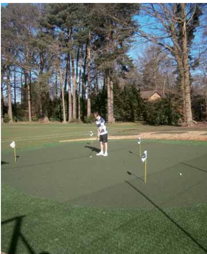
The new putting green, behind the Squash Courts

At the West Surrey Schools' meeting we entered a trimmed-down team of twelve boys, only one of whom failed to place in the top five, and with three who gained selection for the National Prep Schools' Championships in Birmingham. Here they all performed extremely well, securing third, fourth and fifth positions in their respective finals.