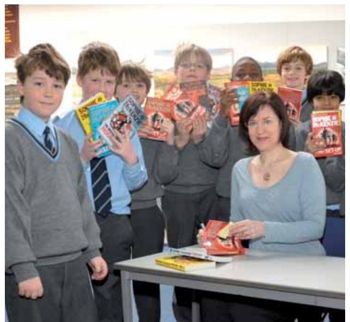
Author Sophie McKenzie signing her books

On the first morning the boys were divided into groups and sent off either to lessons or activities. They learned a lot about Burgundy: in Dijon, they produce the famous Dijon mustard, and Boeuf Bourguignon is one of the specialties. Most of the boys liked it when it was served up one evening, although some thought it tasted like garlic rubber. The activities during the week included cooking, where they learned how to make apple pie, at the same time also learning the French vocabulary for a large number of kitchen utensils. They also visited a circus and learned some circus acts, they visited the castle at Bazoches, went to a restaurant where they had to order their food in French, and they took part in a kayak activity. The boys enjoyed the five days they spent in Burgundy and they learned a good deal of French at the same time.