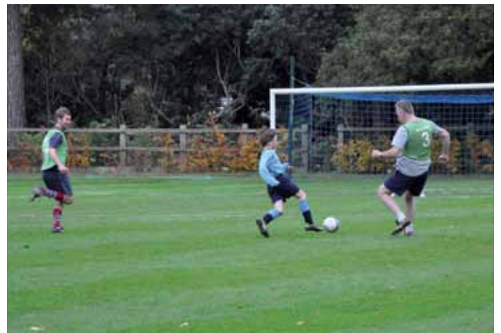
Football v The Staff