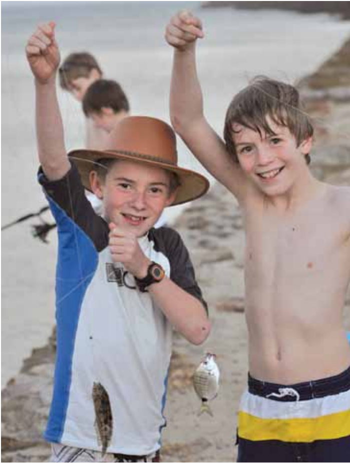
Fishing in South Africa