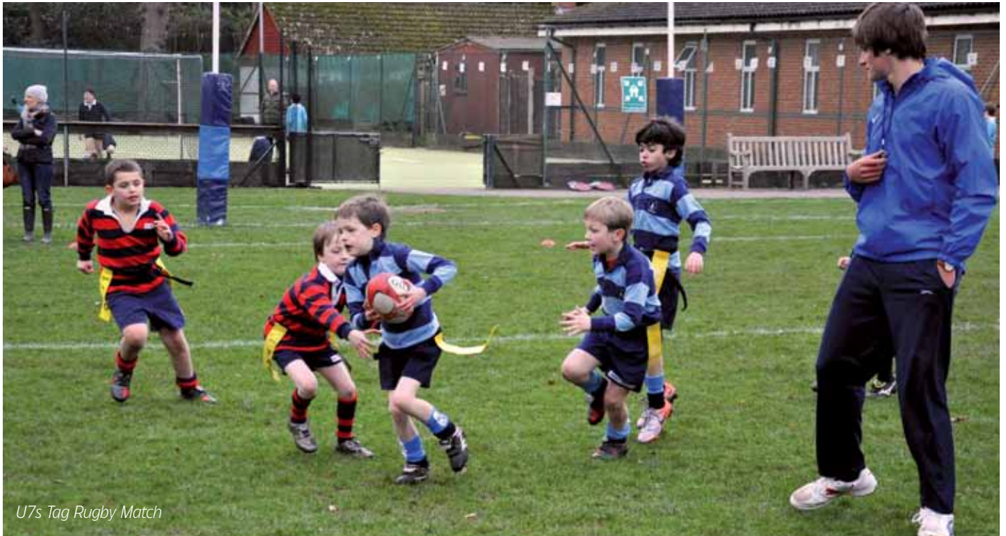
U7s Tag Rugby Match