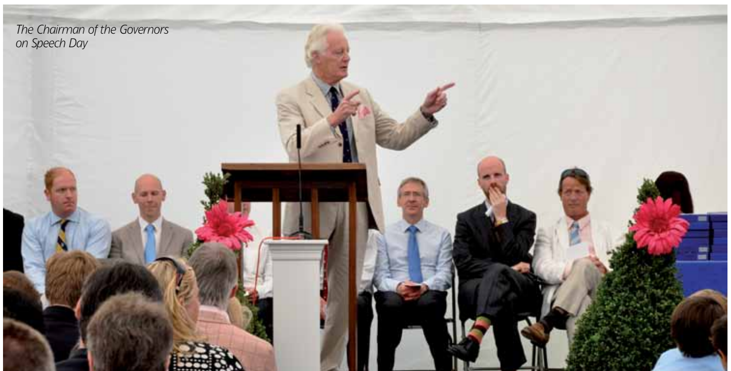
The Chairman of the Governors on Speech Day