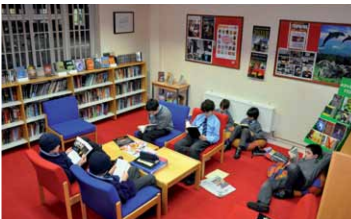
Boys making use of the Library

Reading was perhaps more of a skill than a value, a skill that was so fundamental to the development of character that it assumed the highest priority at Papplewick. One only had to wander the dormitories in the evening, or visit the sports hall gallery after lunch, or see the eyes light up during one of the author visits, and one could see that reading was very much