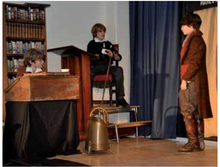
'Ebenezer', the 2011 Christmas Musical