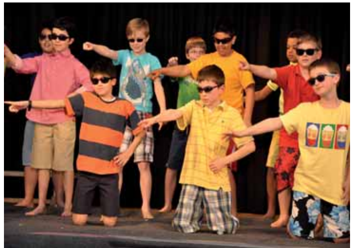
Papplewick's Got Talent in Year 5

Papplewick's Got Talent - This was Variety in its purest form, not just in terms of content but also quality. The judges were genuinely impressed by the gusto with which every line was sung or danced to, and in the end only half a point separated the top two. The acts all oozed quality from every pore and after a recount Seven Up , with keyboards, bassoons, percussion and vocals carried the day, with a most entertaining performance.