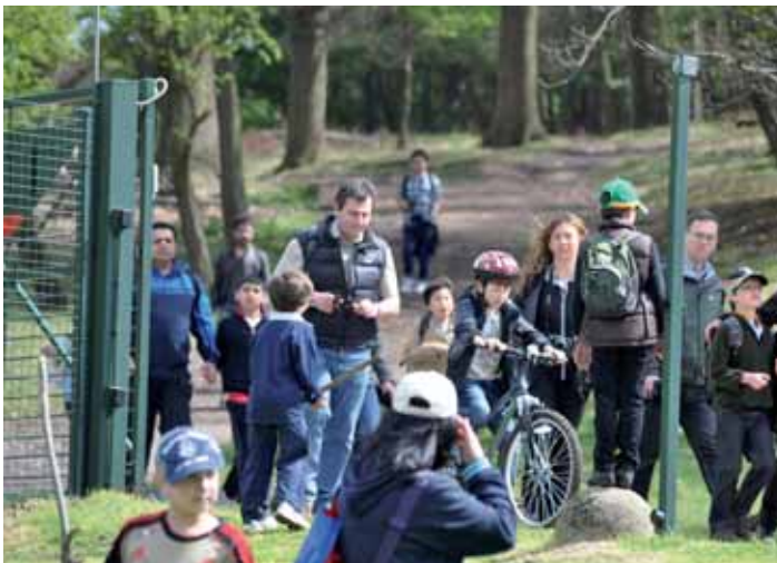
The Sponsored Walk 2012

The sponsored walk took place as usual on the first Sunday of the Summer term and it was a lovely sunny day. Throughout the morning people walked, jogged or ran the ten mile course through Windsor Great Park with the boys enjoying all the flowers, and the waterfall, as well as lots of deer. They managed to secure sponsorship of more than £10,000, which was a huge help for Hope and Aid Direct as the journey to Kosovo itself costs about £3,500. It was all for a great cause, all the more