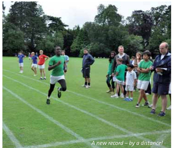
A new record – by a distance!

The best performances came from the senior group, with a very good 1,500m runner, an athlete who threw the shot and discus as most mortals throw marbles, another who starred as a hurdler (reaching the finals of the National Championships) and who was also a very good triple jumper. To go with these class performers, special mention must be reserved for the captain, who, during the season, posted two sub-25 second 200m races (a simply astonishing feat) and broke a twelve year long jump record, going close to six metres.