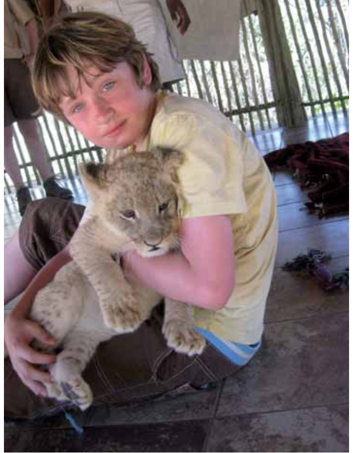
Happy memories of the trip to South Africa

Other visits included the one to the Bush Baby and Monkey Sanctuary, where the boys were met by the pickpocket monkey, and the day at the Pilansberg Game Reserve with all its hippo, elephant and lots of smaller game. They also had a morning of rafting on the Crocodile River and a visit to Sun