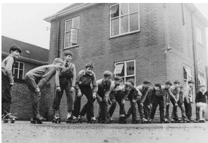
Does anyone recognize any of these roller skaters?

May I make my annual plea for Old Boys who read this to go to the Old Boys' Page of the School web site ( www.papplewick.org.uk and click on About Papplewick and Old Boys.) If you click on the 'Missing Old Boys' icon you will have an opportunity to help locate those Old Boys with whom we have lost contact and whose addresses you may know. Sadly, each year we lose more than we gain.