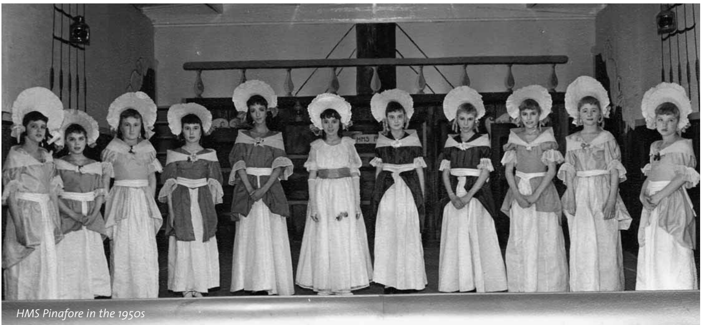
HMS Pinafore in the 1950s