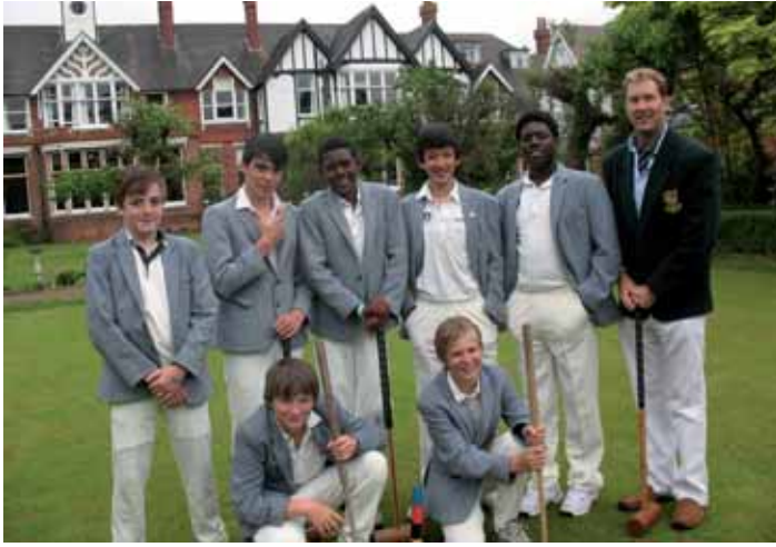
The victorious croquet team