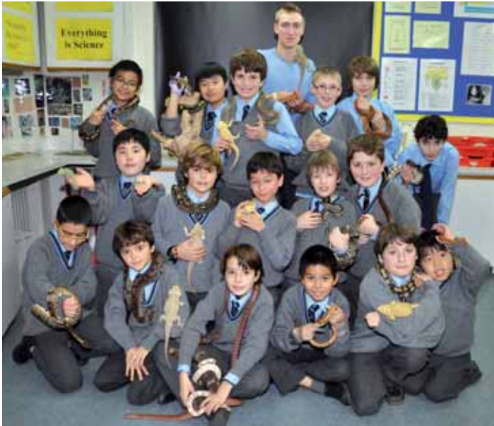
Herpetology is going from strength to strength