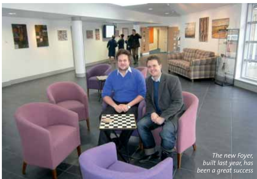
The new Foyer, built last year, has been a great success