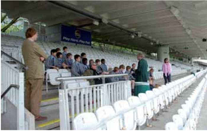
Year 7 visits Lords