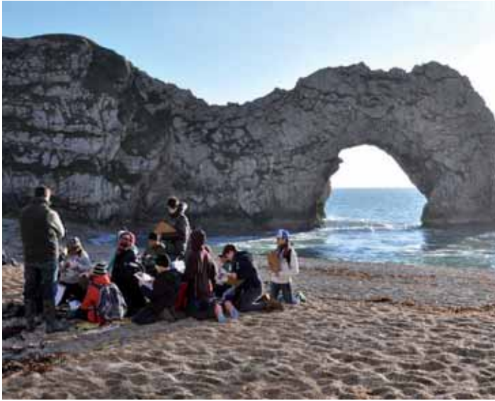
Year 8 Geographers at Durdle Door, on the Jurassic Coast

learning about the King James Bible, they travelled to Eton and saw the real thing. But the outstanding experience was undoubtedly the trip to New York City, where the bibliomaniacs learned a great deal about books, manuscripts and art from two experts who catalogue books and manuscripts on behalf of Arader Galleries. Over the four days the boys were there, they were shown several examples of ancient atlases, they visited the New York Society Library, they had a bookbinding session and they took a trip to the National History Museum Library.