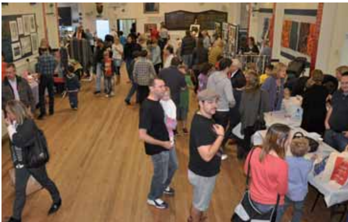
The Christmas Fair

The first two rounds of doubles finished neck and neck and this was followed by the all-important singles round. Even though two of the Papplewick players were in a strong position, they somehow gave away their advantage after a loose shot or two, to leave the scores level once again. With the final doubles round before them and with everything to play for, the two Papplewick pairs embraced the moment with faultless croquet, to finish first and second and to give them a well-earned victory.