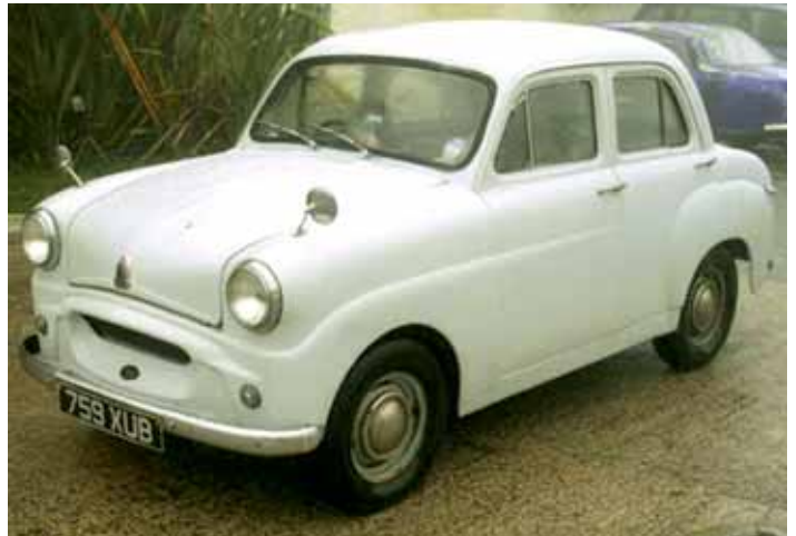
A 'Spanking New Standard 8' like the beige one Rodie bought

I also remember Rodie purchasing a brand spanking new beige Standard 8. At a time when most cars had mudguards, separate headlights and running boards, the all-enveloping bodywork impressed us boys greatly.