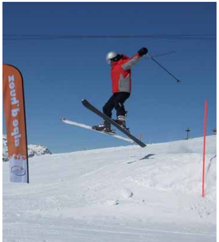
Controlled ski jump in Alpe D'Huez

City - South Africa's most famous resort – where they visited the crocodile farm. The last full day was spent at the Lesedi Cultural Village, where the boys learnt about local tribes in typical villages. This was followed by traditional dancing and singing, which rounded off a wonderful 2012 trip.