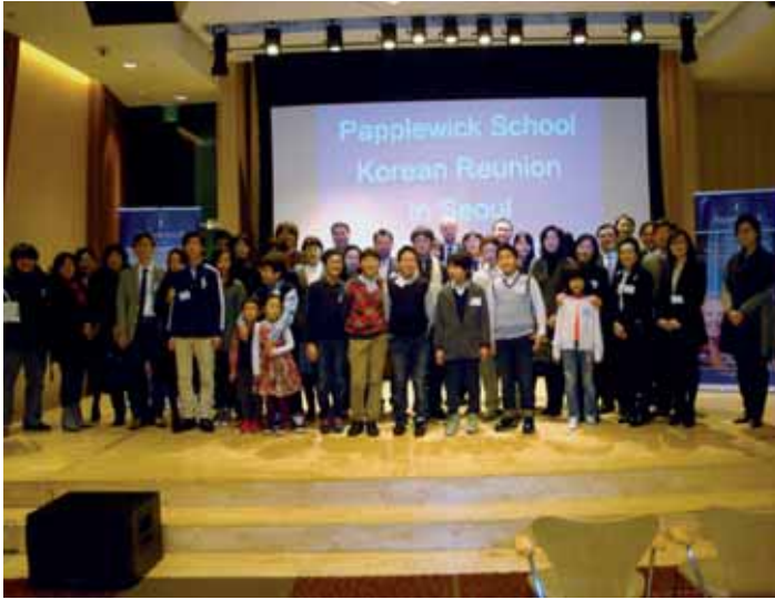
Families of past and present Papplewick boys from Korea gather in Seoul for a reunion