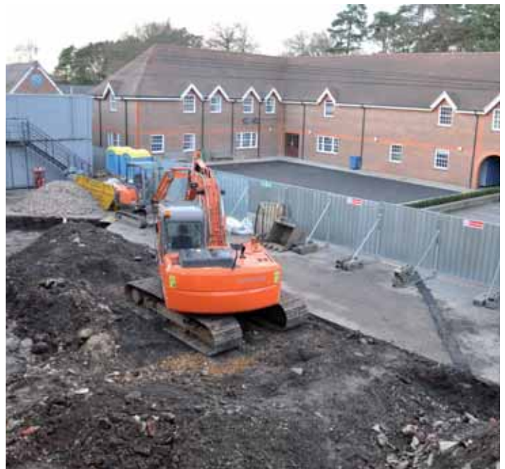
Alterations in the Square