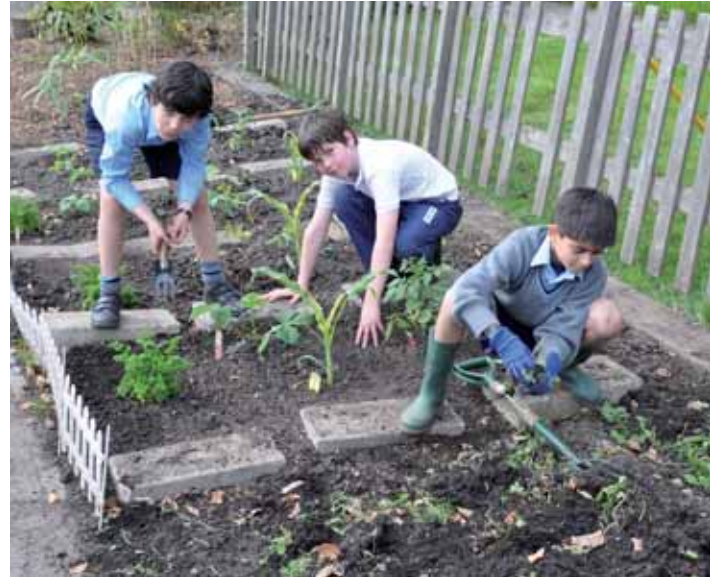
Gardeners at work

European Day of Languages is celebrated on the 26th September every year, demonstrating the importance and need for languages, as it is estimated that twenty languages die every year. So annual workshops are set up by the French department to promote languages. Since many boys at Papplewick come from a wide variety of countries like China, Japan, Russia and Malaysia all the workshops can be led by parents of such boys. They included lessons on Japan, Thailand, Nigeria, Korea and Senegal, which entailed some writing in Japanese using special pens, like paintbrushes, and writing on rice paper.