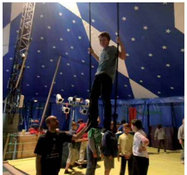
Year 7 in the Big Top in Burgundy