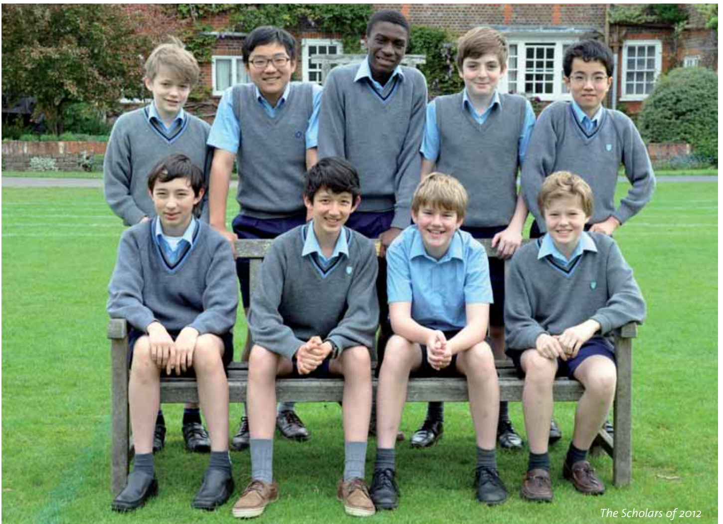
The Scholars of 2012

into the world or on to our senior schools full of confidence.' Mark Twain once said, 'Cauliflower is nothing but cabbage with a College education'. After a Papplewick education, armed with a Papplewick education and all the confidence that comes with it, I hope that our boys only ever leave us as cauliflowers, like the particularly outstanding group of Year 8 cauliflowers whose company we've had the privilege to enjoy this year."