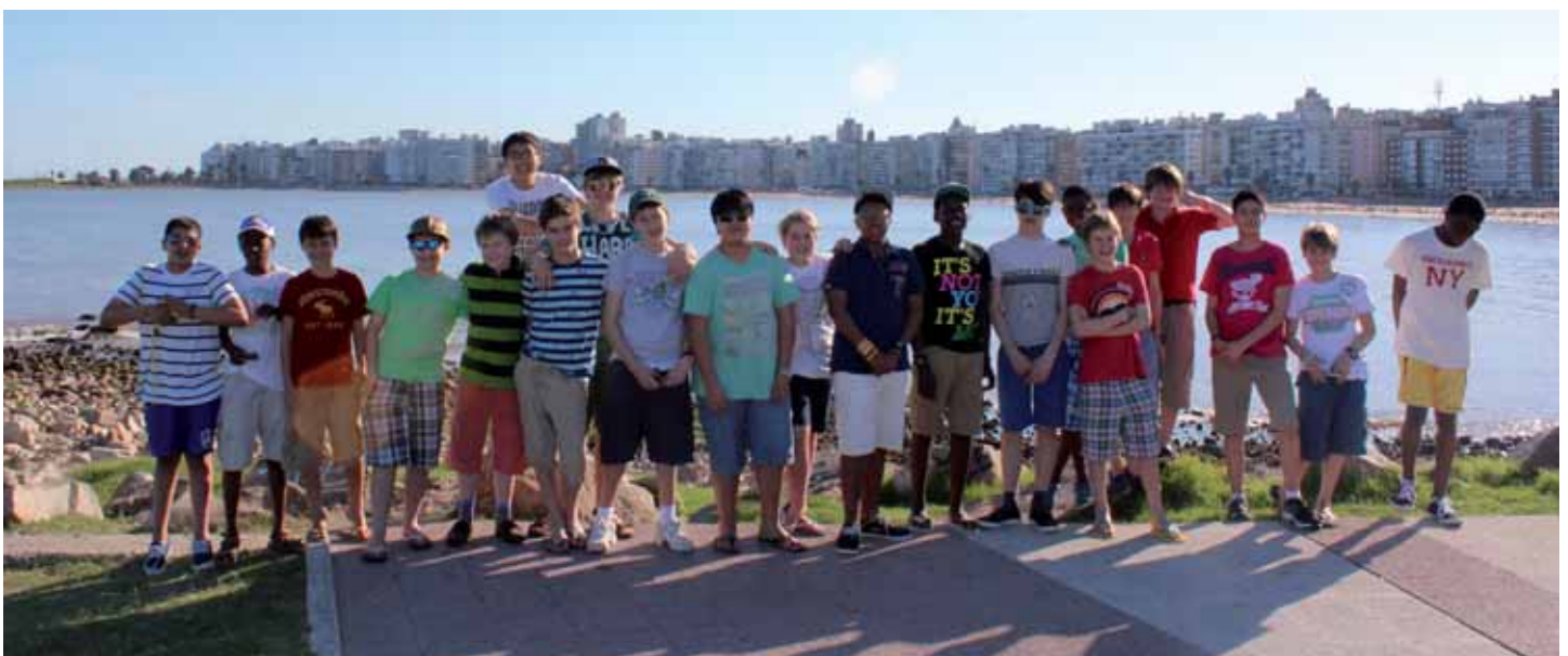
The rugby squad in Montevideo

On paper, this was a very good side with strengths in the majority of areas and with real talent through the spine of the team. It was unfortunate that the opposition sides were also strong and so the boys had a tough season. Slow starts sometimes left too much to do in the second half. But the team showed pluck and determination and it ground out some great results at times, with some outstanding team performances. Considerable strides forward were made as the season developed and the players worked well as a team, considerably improving their knowledge and understanding of the game.