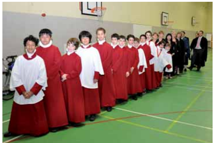
The Choir lining up to process into Chapel

The Headmaster thanked the parents for all the support that they had given to the school over the year, stemming from the special relationship that existed at Papplewick between parents and staff, which he valued so much. He cited the activities they had been involved in – the Hog Roast, the Father/Sons' Camp Out, the Christmas Fair, the Sponsored Walk, the Staff/ Fathers' cricket match, Grandparents' Day, the Golf between Staff and