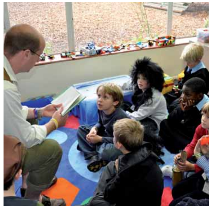
Story time on Roald Dahl Day