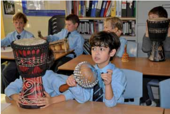
Learning about Nigerian music on Language Day

European Day of Languages is celebrated on the 26th September every year, demonstrating the importance and need for languages, as it is estimated that twenty languages die every year. So annual workshops are set up by the French department to promote languages. Since many boys at Papplewick come from a wide variety of countries like China, Japan, Russia and Malaysia all the workshops can be led by parents of such boys. They included lessons on Japan, Thailand, Nigeria, Korea and Senegal, which entailed some writing in Japanese using special pens, like paintbrushes, and writing on rice paper.