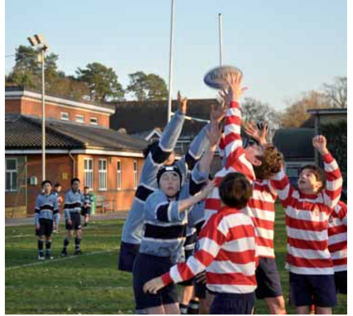
Papplewick needs to win this lineout

counted. That said, the 50% win rate, reaching the finals of the Wellington Prep Schools' Rugby Tournament and an enjoyable rugby tour, made for a rewarding season overall.