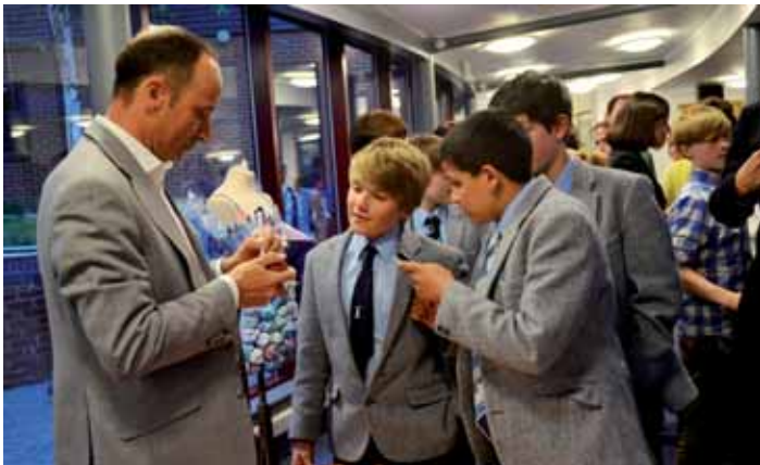
Nasser Hussain comes to Papplewick

The 1st XI were certainly a stronger side in the field than with the bat, with plenty of bowlers to choose from, all of whom managed to achieve some success. But it did struggle with its batting and never really put together an innings that would test an opposition. The side endeavoured to address this with some long and hard work in the nets, but to little avail. While it did produce some individual improvement, the team still struggled to get any real partnerships going and it was only towards the end of the season that one began to see some real 'team' efforts, with several players chipping in with respectable scores of 40+ or so. The one area in which this side did shine, however, was in the field, where the boys were often quite inspirational in their ability to stretch to make a catch or to chase down a ball in the field. Some strong arms also saw a number of opposition batsmen caught stranded, with some excellent run-outs. Despite the results then, it was a season that saw the boys finally grow into a unit that gave of its best in any situation.