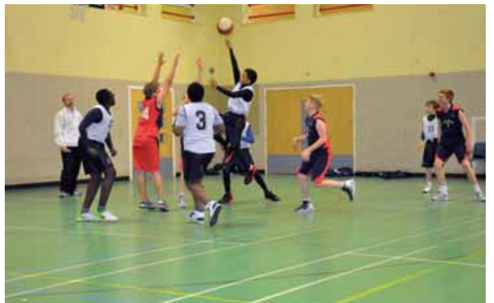
Basketball is becoming increasingly popular

The Colts squad had five fixtures and put in some excellent performances. The best of those was against Yateley Manor with a 31-3 victory. The successful season came as a result of considerable skill, hard work and a good deal of determination.