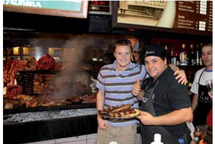
Argentinian hospitality on the rugby tour

Later that day we boarded a ferry that took us across the Plate Estuary, from Montevideo to Buenos Aires. Our first match in Argentina was against St. Catherine's Moorlands, well-known visitors to our school, having played a number of football matches against Papplewick when on tour in the UK. We struggled against a hefty side of mostly U14s, losing 32-7 but won our next back-to-back game decisively against a younger U13 side. After two days in Buenos Aires we travelled by coach north to Rosario, the heart of Argentine rugby. Club Atlético de Rosario dates back to the late 19th Century, when the British community, living and working on the railways at the time, introduced rugby to the locals. The game is now played there with great pride and passion. This meant that we were pummeled by their U14 juniors and given a serious lesson in rugby, losing our match by 40 odd points to 0! Our final fixture against St. Andrew's Scots School, saw us beaten narrowly 45-40,