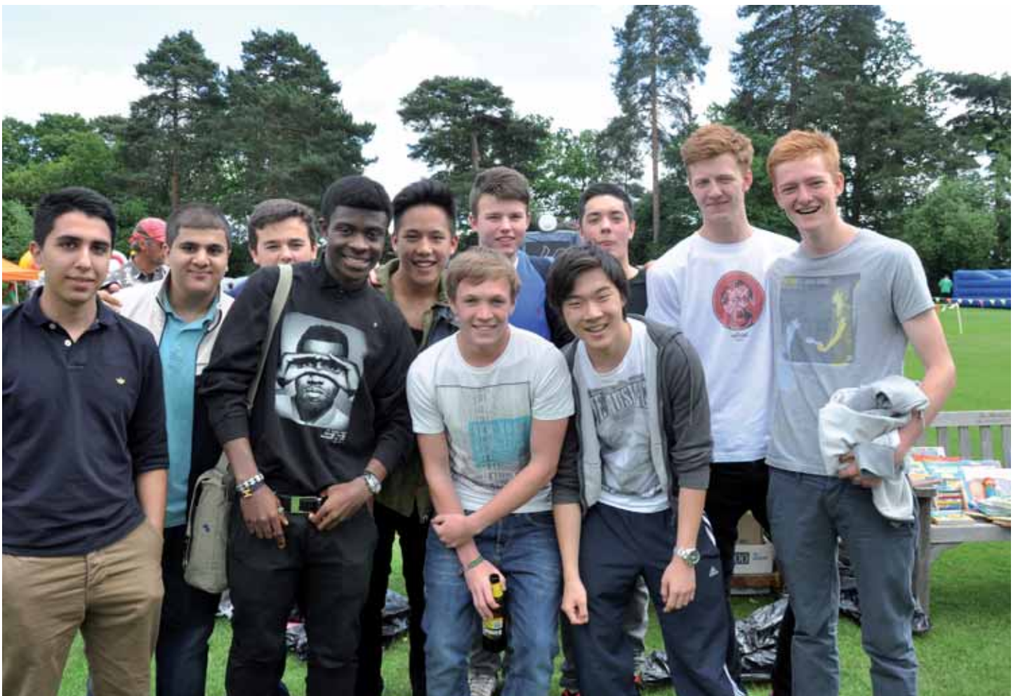
Visiting Old Boys, back for the Hog Roast last year

The Bibliomaniacs are a small group of boys, aged between ten and thirteen, who are interested in the history and culture associated with antiquarian books. 2012 was a year full of visits to second-hand bookshops, the Eton College Library and the British Library. These trips enabled the boys to see in person examples of what they had been studying. For instance a matter of weeks after