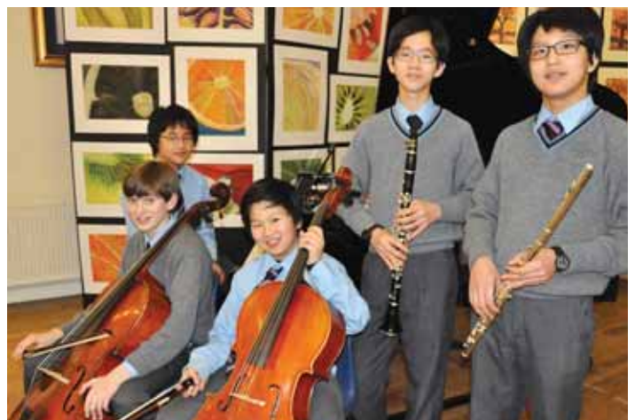
The five Music Award Winners