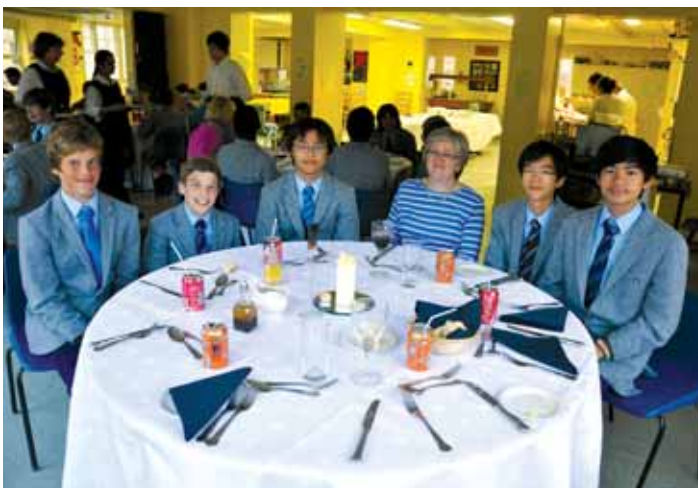
2011 Leavers' Dinner

The Headmaster paid tribute to all the members of the Papplewick staff for their dedicated work, saying that the Ofsted inspectors, who had visited the School last March, certainly recognised this, for they had commented on it in their report saying, "All boarding, maintenance, catering and cleaning staff work very hard to achieve excellence through effective team work and long hours. The overall rating of 'outstanding' reflects on all staff and pupils."