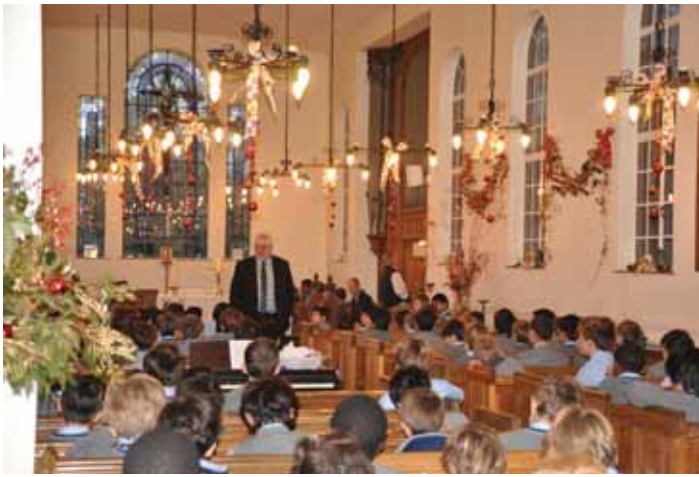
Getting ready for the Carol Service

a job which he loves – even though he has to get up at 4.30 a.m! When we saw him in July he was about to start on a course in turf management. He aims to end up working at an open championship course.