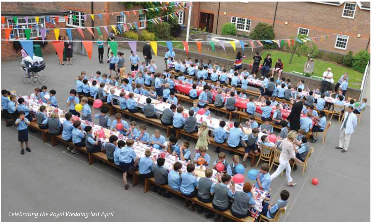
Celebrating the Royal Wedding last April