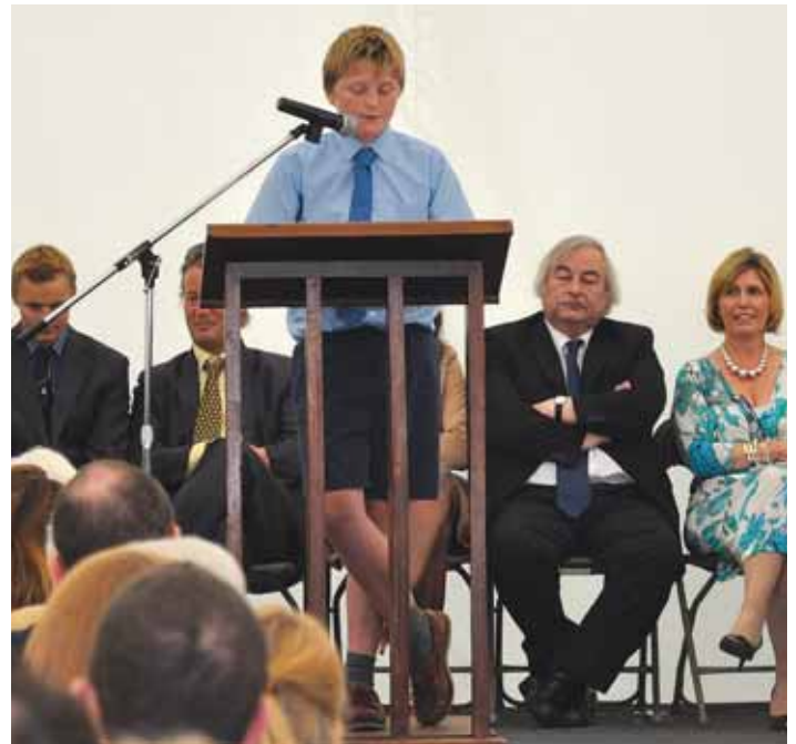
The Head of School making his speech on Speech Day

The Headmaster reported that the School had had another very good year with its drama. We had seen performances of 'Joseph and his Amazing Technicolor Dreamcoat' and 'Swinging Samson,' the play produced by Years 2-5. There had also been