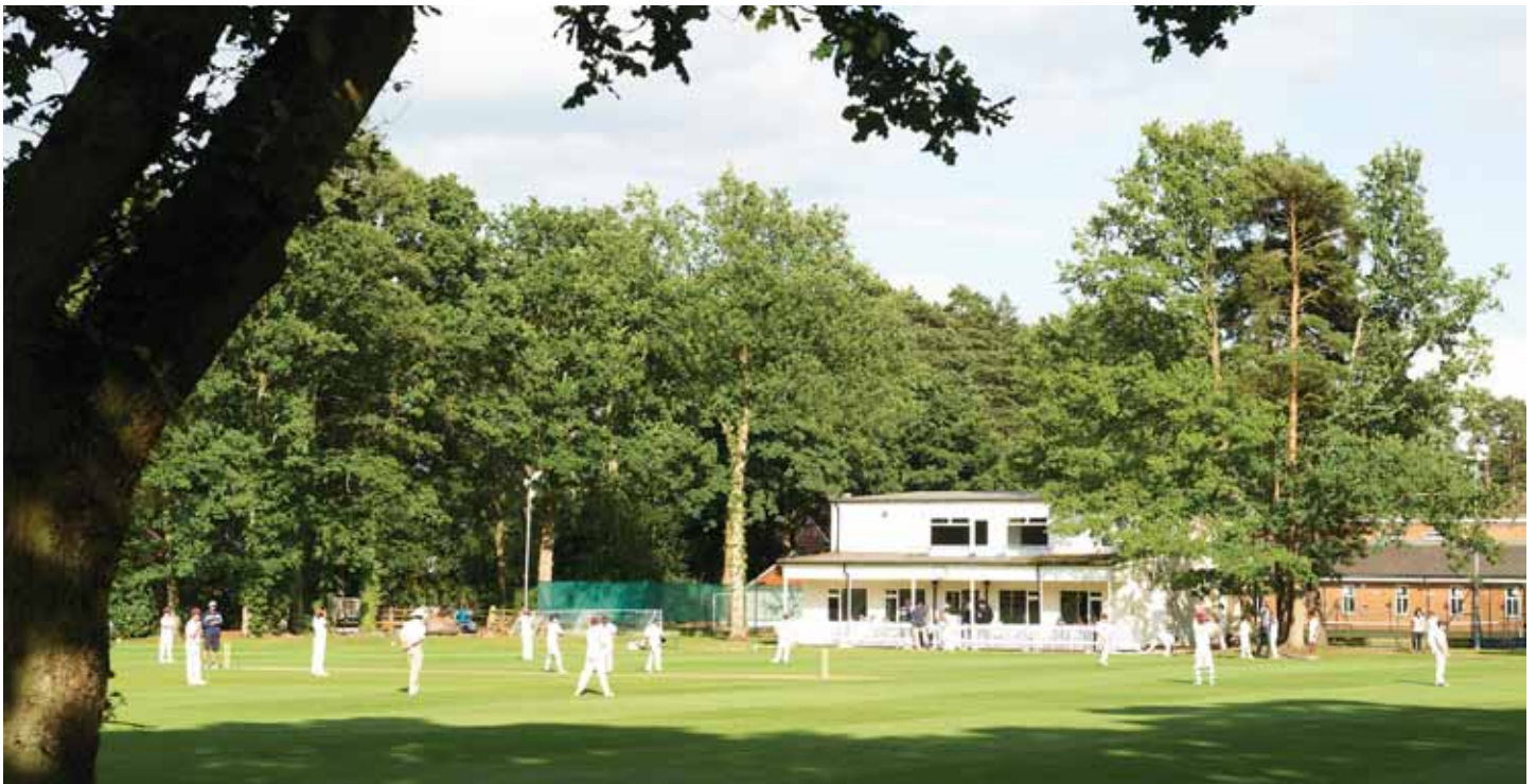
The Cricket Square

One disadvantage of playing rugby in the Lent term only was that we came across opposition with a term's rugby behind them, so they were that much more prepared for battle. This meant that Papplewick had an average season only, though the side improved as the term progressed, with the outsides growing in confidence and learning to discern between slow and fast ball and how to react to various situations.