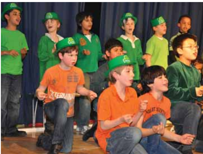
Year Four celebrating Green Day

Parents will realise just how lucky their sons are to have such an opportunity of participating in confidence-building activities of this nature. Perhaps the actual participants will too, later on in life.