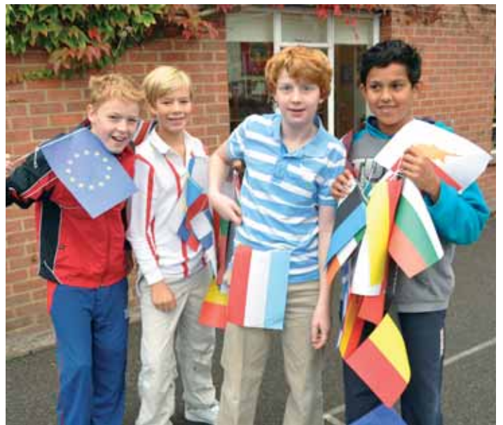
European Day 2011