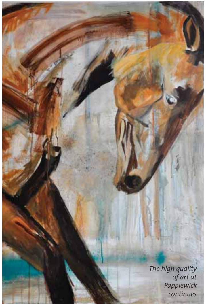
The high quality of art at Papplewick continues

Year 6 The 6th Year got into the swing of things with a light and lyrical rock 'n roll take on the story of Samson and Delilah, full of exotic costumes and groovy music. Good lead performances, solid supporting performances, fine dance movements and excellent songs in which everyone got involved, produced great enjoyment on both evenings.