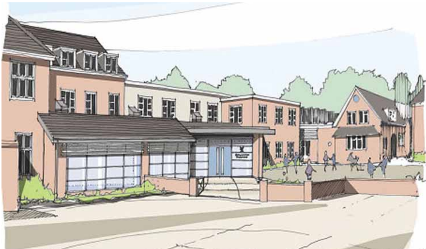
Sketch of what the New Building Project will look like

On these days pupils have their classes - English, Maths, Art, Music and the other subjects – taught in French. In Art, Monet was discussed, with some of his work and paintings being studied and with the boys having to write something about the painter in French at the end of the lesson. French mathematical terms were used in Maths lessons, the geographers had to write about Windsor shops in French, and woe betide any boy in the PE class who used non-French terminology during the game of football, for he received an immediate red card!