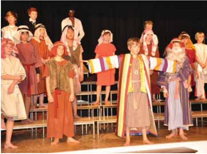
Joseph and his Amazing Technicolor Dreamcoat

Drama 2010-11 was another very successful year for drama, with 'Joseph and His Amazing Technicolor Dreamcoat' being the main School play. It was a triumph, with the cast acting above itself and surpassing all expectations. The Musical zipped along from one brilliant song to the next and with adept casting and clever choreography the overall effect was wonderful. As ever, the music staff ensured that the singing was of the highest standard, and this, of course, really made the evening.