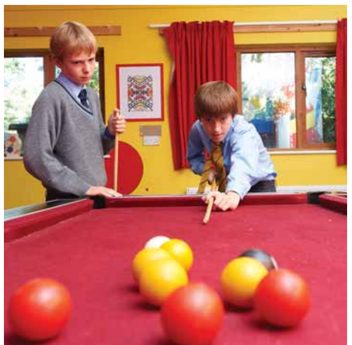
Life in one of the boys' Common Rooms