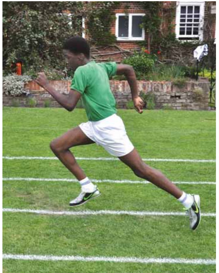
A successful sprinter and long jumper

Athletics - The School is fortunate in having a number of boys who are good in the sprints and middle distance events, but technical know-how is lacking in too many of the field events to enable the team to win matches. We really need some winter training behind us when we start our season if we are to