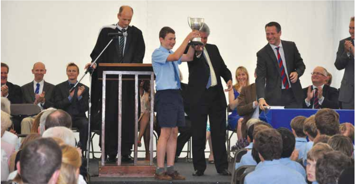
The winner of the 2011 Knatchbull-Hugessen Award

another first class joint production, 'Tom's Midnight Garden' with the girls of St Mary's, Ascot. Art of a very high standard had once again been on display, and some exceptional work had been produced by boys in their Design Technology projects.