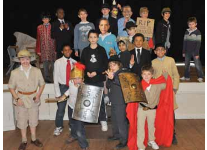
Heroes' Day 2011