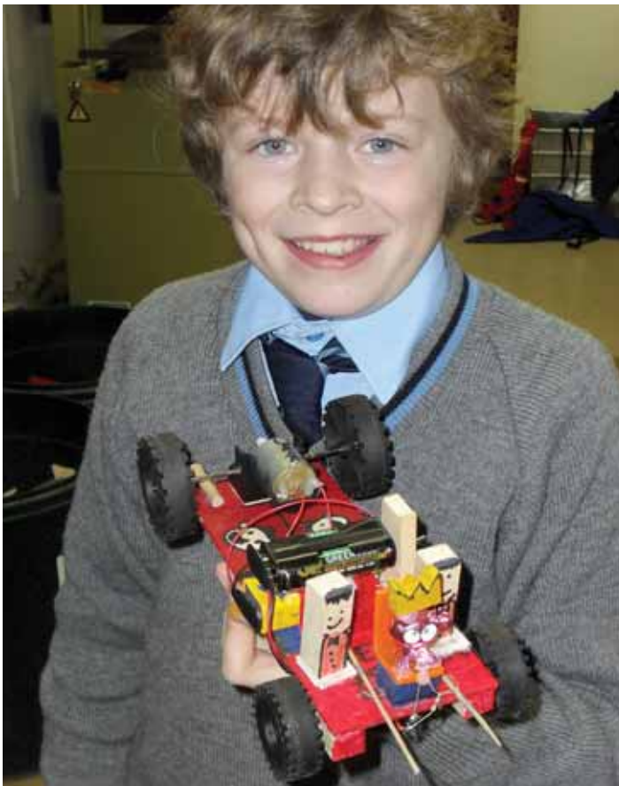
DT - Electric Buggy

Papplewick's got Talent Back for the fourth consecutive year, the talent on show was the best yet and the judges were on fine form. They had a hard job selecting the most talented, but in the end they came to the unanimous decision that Maz-if Attack, with their thunderous version of 'Written in the Stars' should get the prize.