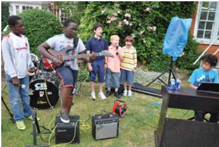
Pop Idols at Play