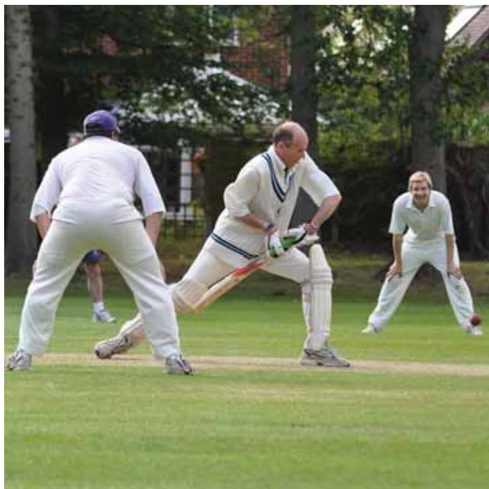
The HM on the Defensive

Once again the swimming pool and tennis courts will be available for families and friends. We shall be delighted to see you there, either at lunch or later on. Old Boys who left Papplewick in 2002 are particularly invited this year, ten years on, and you will be receiving a personal invitation with this newsletter. Last year's reunion was particularly successful, so do come if you can. It will be good to meet up with your contemporaries and have a look around. You will be surprised at the changes, if you have not been back since you left. We shall be posting last minute details on the morning of July 8th, by 9.00 a.m. on the Old Boys' page of the School website ( www.papplewick.org.uk ). Just click on 'About Papplewick' and 'Old Boys'. In the event of uncertain weather it is important to do this, as both fixture and the reunion of 2002 may have to be cancelled.