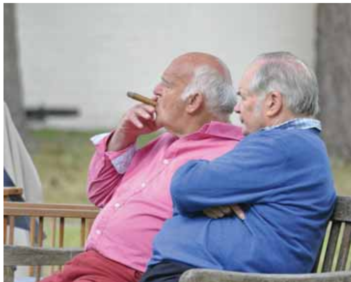
"I'm glad the HM didn't ask us to play this year"

We always need news from Old Boys about what they have been doing recently, so please contact us to keep us informed - preferably with a photograph - emailing it to sparsant@gmail.com . We look forward to hearing from you.