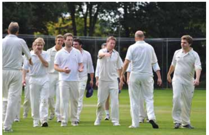
"Well played, the Old Boys!"

Clay Pigeon Shooting continues to flourish, with the boys going off to practise at Bisley once a week. They are building up their repertoire of shooting disciplines, which now include Settling Pigeon, Springing Teal, Bolting Rabbit as well as Full Flush. This sport is great fun and is thoroughly enjoyed by those who take part in it.