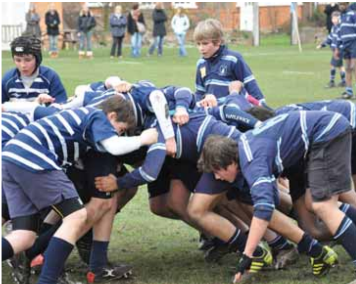
Forwards at work

The 1st XI had a fair term, with good wins scored against Eagle House (3-1) and Summer Fields (2-1), an exciting draw with Lambrook (1-1) and a disappointing defeat at the hands of Cranleigh (4-1), where they took their chances and Papplewick failed to do so. The most exciting game was played in the Summer Term, though, when St Catherine's Moorland came on tour from Argentina. Papplewick has played them when it has gone on its South American tours, so we were glad to see them back here. It was a very even game, with little between the two sides, and the final 2-2 draw resulted in extra time being played. The 'golden goal' was eventually scored by Papplewick.