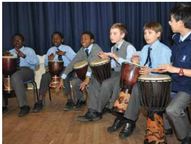
Arts Festival – Drumming Workshops