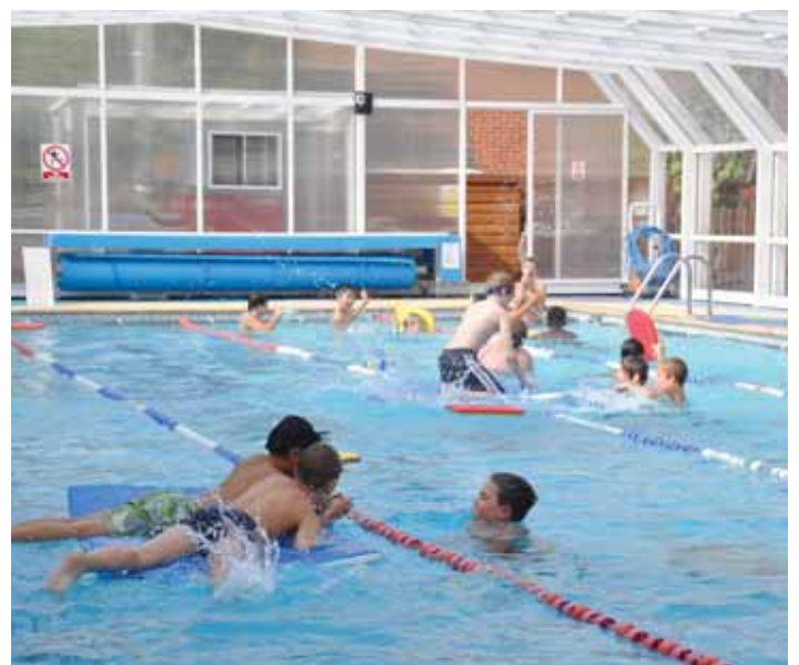
Fun in the swimming pool