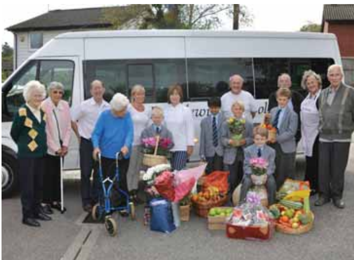
Boys delivering produce from Papplewick's Harvest Festival to the Ascot Day Centre