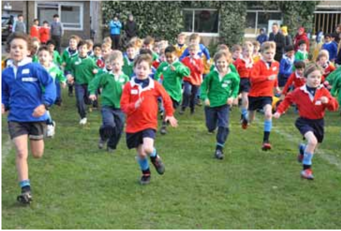
House Cross Country start