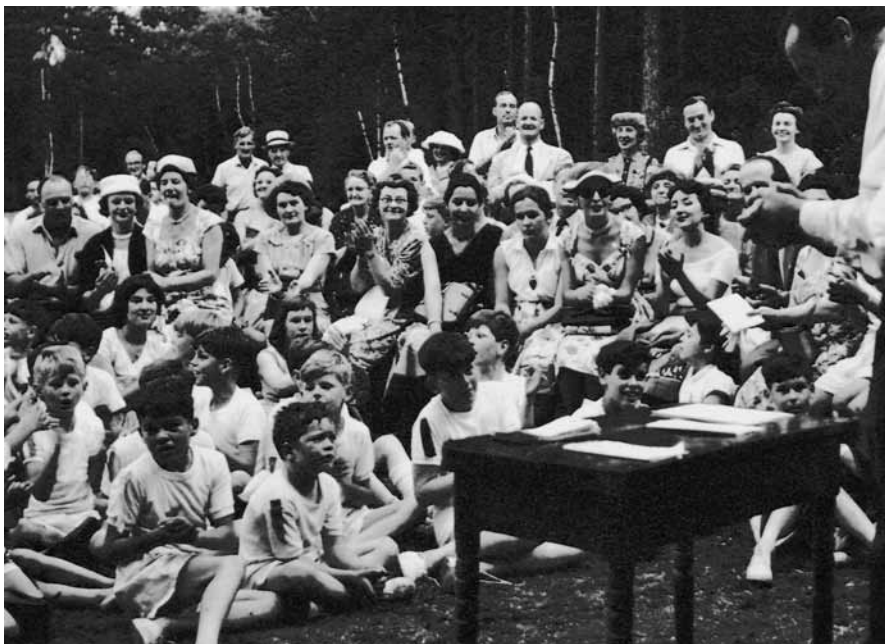
Any ideas who any of these boys from 1957 are?