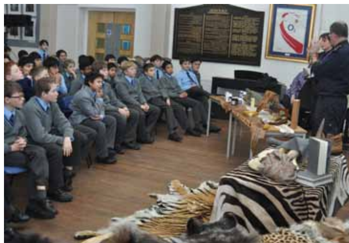
Tuesday evening talk

Not every school boasts of having a 5th XI, but these Papplewick boys produced the most exciting cricket in the School last season and they had a lot of fun in the process, with two tied matches: