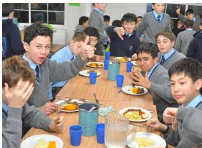
Who likes Haggis?