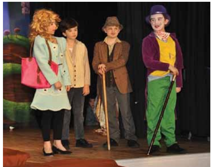
Charlie and the Chocolate Factory

In 2016 the Year Six boys put on the production of Charlie and the Chocolate Factory. The well-known story by Roald Dahl was brought to life by the boys and the play was a fantastic success, with all the actors really throwing themselves into their roles and providing great entertainment to the packed hall.