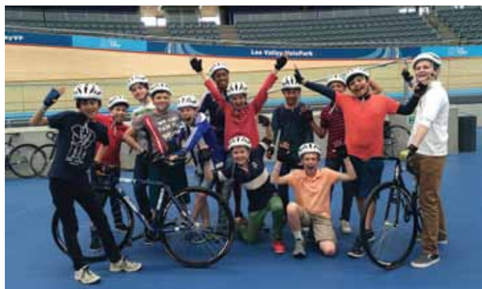
Year 7 boys at the Olympic Park

Once again the talent was on full display as the finalists took to the stage competing to come away with the coveted title of 'Papplewick's Got Talent Winner 2016'. We were spoilt with the display of talent and the judges deliberated for a very long time before they came to a decision about who should win. The magicians wowed us with their incredible tricks, the dancers put on a fantastic show of energy and skill, the singers hit all the right notes and the swegway dancing was something