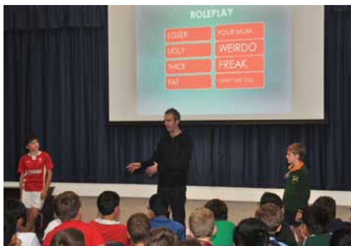
Discussion and role play about kindness to others

But if ordinary, everyday things have been a source of inspiration so too have been the extraordinary. The Headmaster congratulated the fourteen boys who had been awarded scholarships and exhibitions to their public schools in disciplines across the board - academic, music, art, drama, sport and all-round ability. "One of the joys of Papplewick is that it's considered cool to be in the art scholars' programme; it's cool to be in our wonderful four-part 1st choir; it's cool to be part of the Bibliomaniacs who are now, rather extraordinarily, the youngest professional booksellers in the world; and, of course,