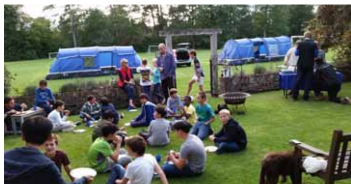
Boarders camping on the first week end of term

The Headmaster said that this year he had been inspired by both the extraordinary and the ordinary, with some of the ordinary things being the most inspiring and often the bits that you don't see; bits that take place every single day. "These can start in chapel at 8.30 in the morning with 200 boys singing their hearts out - and it's not for show. It's because it feels good to join together to start the day by singing together - it goes to the heart and soul of the school. And then, later on in the day, it's inspirational to see thirteen-year-old boys allowing seven-year-old boys to take them on at square cricket, or handball, or to see boys of all ages sharing their crazy, eccentric love of snakes and reptiles in the Science lab. This mixing across age groups that is very characteristic of Papplewick is so important to the collegiate or family feel of the school; of little and big boys feeling "we're all in this together". And every day here finishes with life in the dorms, at the heart of which is quite simply 'fun with your friends', like any good sleepover."