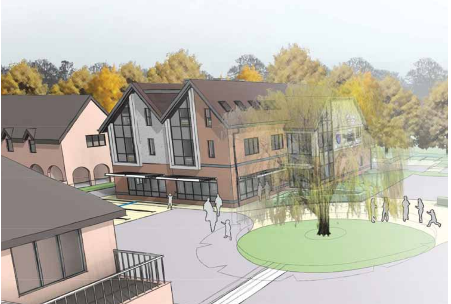
New Year 8 Boarding House