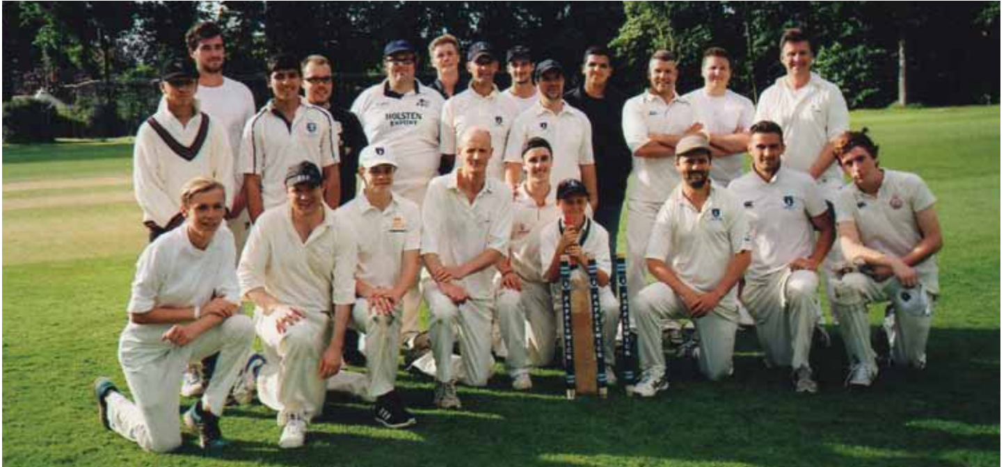
The HM's XI with the Old Boys' team after a close match last year