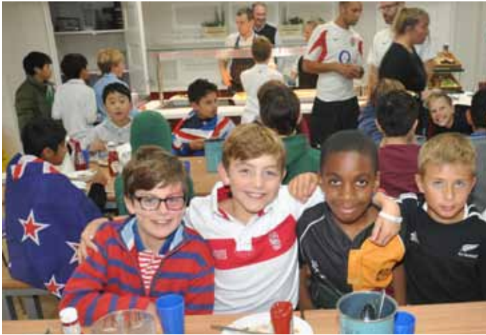
Rugby World Cup Dress Down Day

The Season began with real concerns about a lack of experience, a lack of real ball players among the backs and a lack of depth. At our inaugural meeting we discussed our objectives and looked at perceived strengths and the decision was taken at that point to base our game on high-tempo, high-risk, high-reward and high-enjoyment, even if that meant the results not always coming our way. Consequently, there was a concerted effort made to raise the basics of handling and tackling to the highest possible level and look to use the ball as best and as unexpectedly as possible.