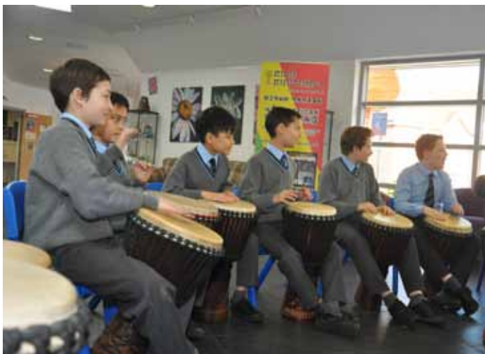
Drummers at work in the Arts Festival

A Disney classic, the boys did sterling justice to the original and entertained one and all with their take on songs and choruses that have stood the test of time. The entire cast, from our handsome hero to the beguiling Jasmine to the brooding villain, Jafar, to a humble harem girl and everyone in between, performed admirably and sang, danced and acted with bubbling enthusiasm and great aplomb.