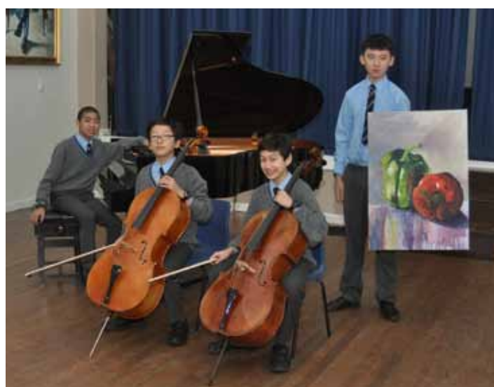
Art and Music Scholars