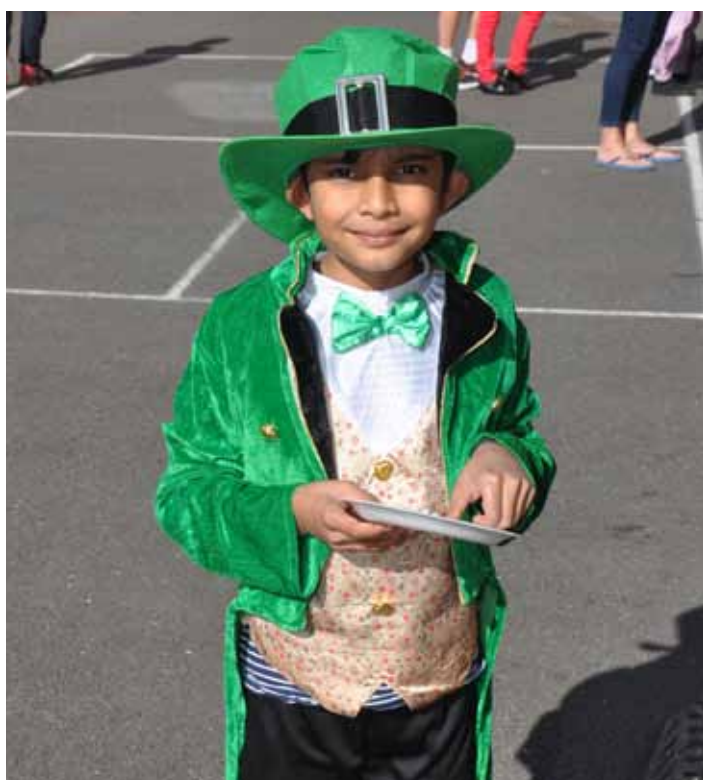
European Day of Languages