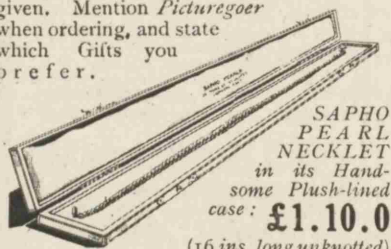
SAPHO PEARL NECKLET in its Handsome Plush-lined case: £1.10.0 (16 ins. long unknotted)

FOR every purchaser of a Sapho Pearl Necklet through this advertisement, a Pearl-Mounted Brooch, pair of Earrings, Stud, or Tie-Pin (Value 10/-) will be reserved. A few days before Christmas the gift chosen will be forwarded post free, on behalf of the purchaser, to any address given. Mention Picturegoer when ordering, and state which Gifts you prefer.