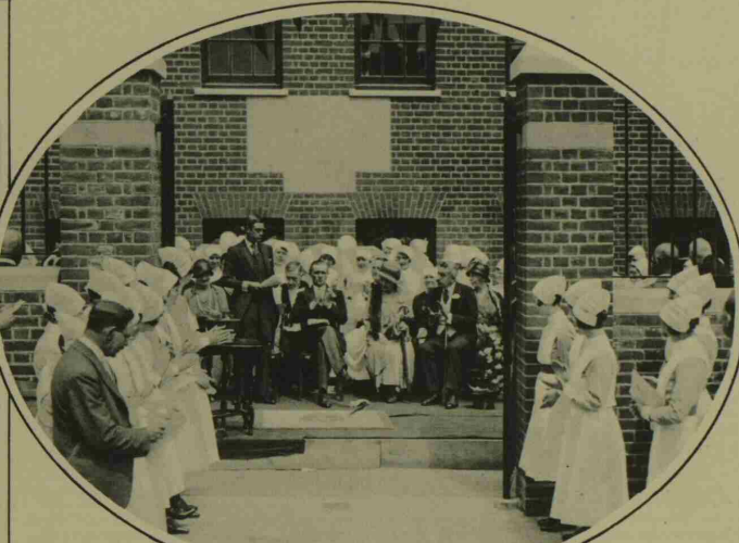
THE PRINCE OF WALES OPENING A NEW DEPARTMENT AT THE PRINCE OF WALES'S GENERAL HOSPITAL, TOTTENHAM: H.R.H. SPEAKING.

On July 23 men from all parts of the country attended the annual reunion of the Royal Naval Volunteer Reserve Association at the Crystal Palace. The Bishop of London conducted an impressive service on the terrace, known as the "quarter-deck" during the war. Admiral Sir Charles Madden, speaking at the official luncheon, said that the British Navy at the moment was down to bed-rock as a result of the country's efforts towards disarmament.