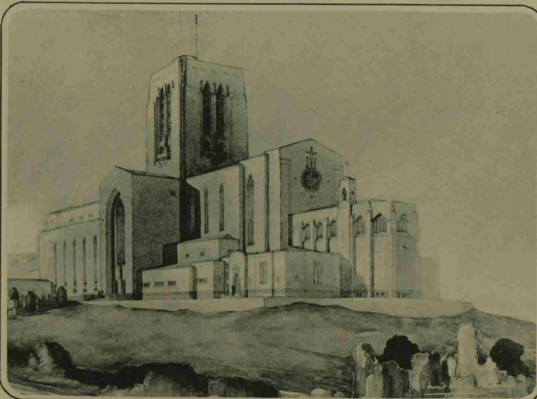
THE PROJECTED NEW CATHEDRAL AT GUILDFORD: THE WINNING DESIGN, WHICH WAS SUBMITTED BY MR. EDWARD MAUFE, F.R.I.B.A.