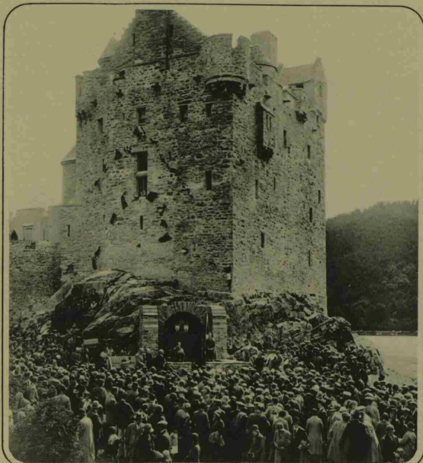
THE OPENING OF THE CASTLE OF EILEAN DONAN, ROSS-SHIRE, AFTER TWENTY YEARS' WORK OF RESTORATION: THE UNVEILING OF THE MEMORIAL.