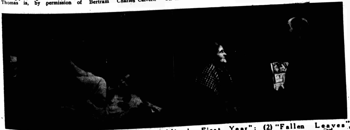
Adapted from Pan stories: (1) "Geraldine's First Year"; (2) "Fallen Leaves"