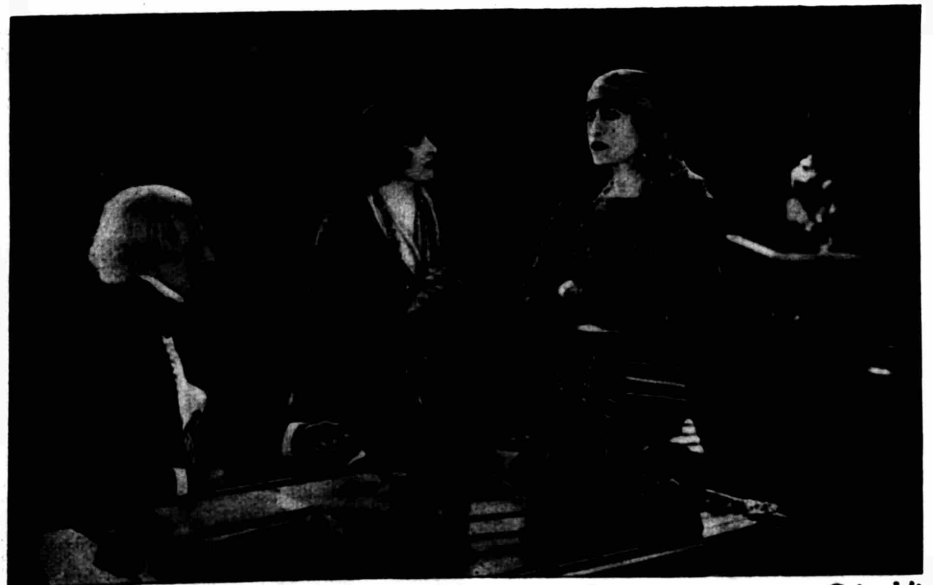
A Scene from "The Bohemian Girl"