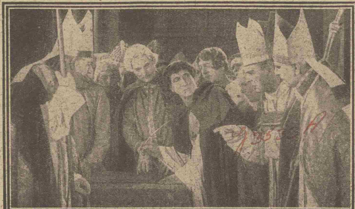
SIR FRANK BENSON FILMED. —Sir Frank Benson (holding pen) in the title-role of "Becket," a dramatic historical film, to be shown during British film week.