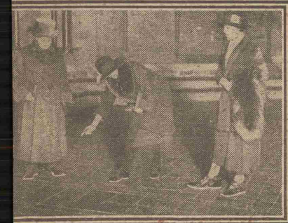
itors, wearing sandals, on the newly-restored floor. ter House of Westminster Abbey now don sandals red to full decorative beauty.—(Daily Mirror.)