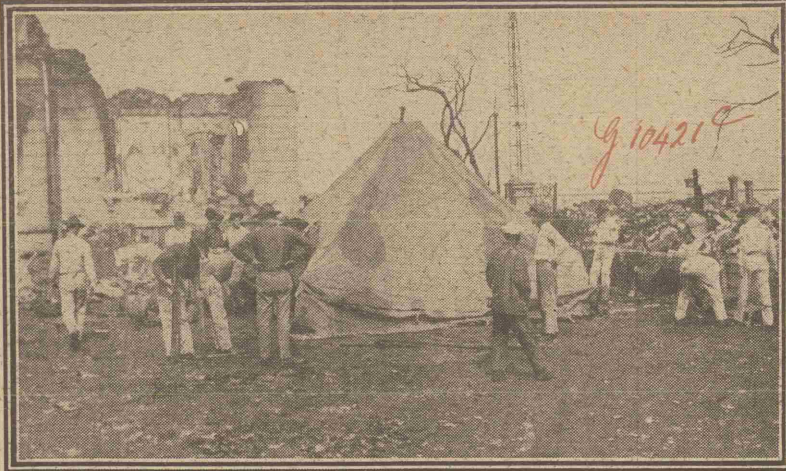
United States marines putting up a tent, which is used in ruined Yokohama as the United States Consulate. It stands amid the remains of the Standard Oil Company's offices.