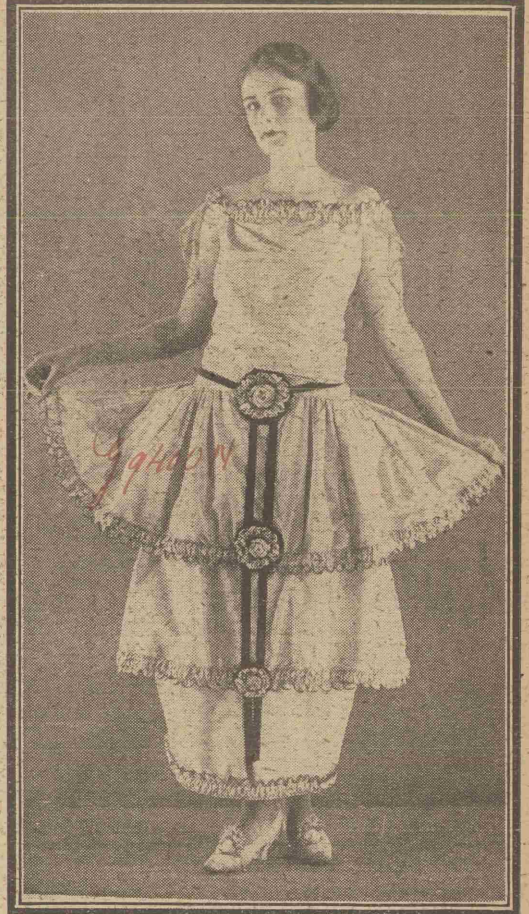
This charming evening gown, which is one of Lucile's new creations, is in shot pink taffeta and is prettily trimmed with green piping and roses.